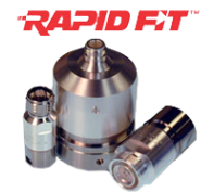
RAPID FIT™ Connectors

Radio Frequency Systems' line of high performance coaxial cable connectors are designed specifically to provide the highest quality connector-cable interface while simplifying and speeding up the attachment of connectors to CELLFLEX® coaxial cables. RFS connectors are fully tested for mechanical and electrical compliance specifications. They are available in all popular cable sizes in a variety of mating interfaces. To join two cables with EIA connectors, two identical socket connectors are installed on either end of the cables to be joined, and a coupling element is used to make the connection of the center conductor. The coupling element must be ordered separately with the exception of the S-Line male versions that have a captivated coupling element. Connectors are available in sizes matching the nominal cable size. EIA connectors provide optimal power handling for the complete transmission line system.