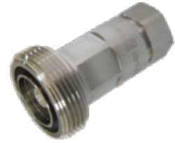
OMNI FIT™ Standard Connectors

OMNI FIT™ high performance connectors are designed for use with both CELLFLEX® (copper) and CELLFLEX® Lite (aluminum) cables. They are designed specifically to provide the highest quality connector-cable interface while simplifying and speeding up connector attachment. All RFS connectors are fully tested for mechanical and electrical compliance to industry specifications. The 7-16 connector is the most rugged RF connection meeting all requirements even under the most severe environmental conditions.