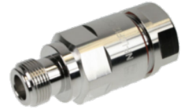
OMNI FIT™ Standard Connectors

OMNI FIT™ high performance connectors are designed for use with both CELLFLEX® (copper) and CELLFLEX® Lite (aluminum) cables. They are designed specifically to provide the highest quality connector-cable interface while simplifying and speeding up connector attachment. All RFS connectors are fully tested for mechanical and electrical compliance to industry specifications.